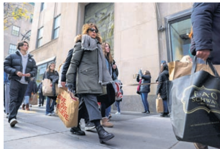
Shoppers carry bags down Fifth Avenue on Friday, Nov. 25, 2022, in New York.

Americans' spending has been resilient ever since inflation first spiked almost 18 months ago, but the capacity of Americans to continue spending in a period of high inflation may be beginning to ebb. Inflation has retreated from the four-decade high it reached this summer but remains elevated, enough to erode the spending